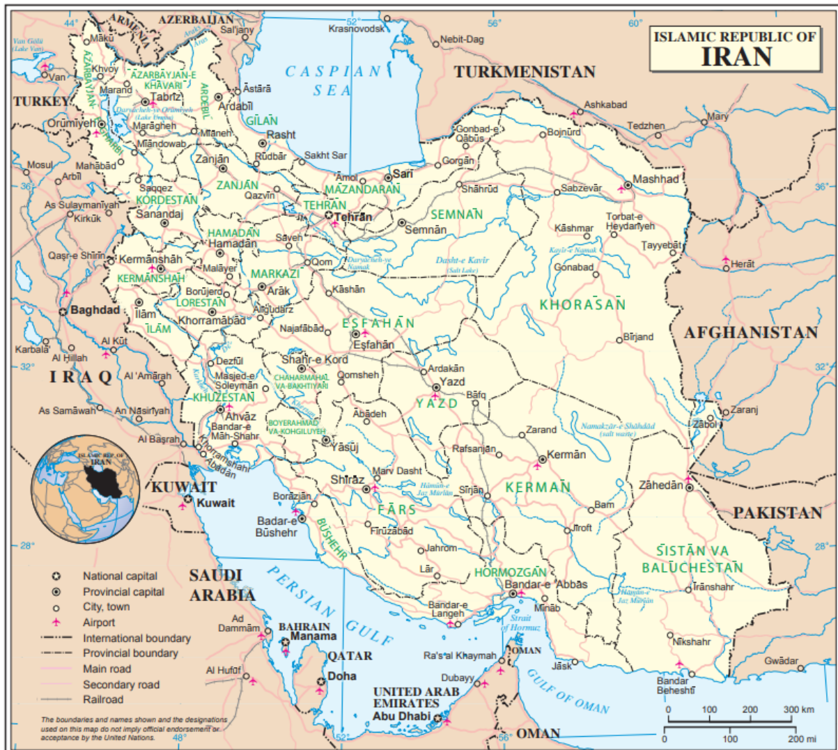
Map 1: Iran (Islamic Republic of), © United Nations. 4