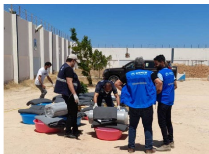
Distribution of core relief items in Ganfouda DC.

On 29 and 31 May, to celebrate the Menstrual Hygiene Day, UNHCR, together with partners CESVI and IRC, hosted events at the 'Women and Girls Safe Space' and at the Community Day Centre (CDC), with the participation of 40 women and girls from the asylum seeker and refugee community. Dedicated sessions were facilitated by a gynaecologist, and the participants were provided with hygiene kits including Information, Education and Communication (IEC) materials.