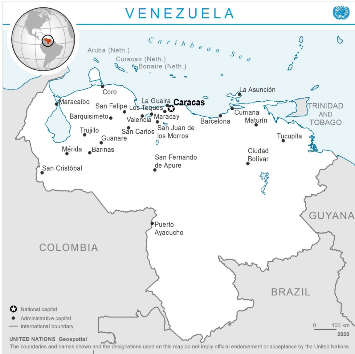
Map 1. Venezuela. 5

Two maps of Venezuela are provided below. A UN map of Venezuela from 2020, as well as the 2021 official map of the Venezuelan government. Venezuela considers the Esequibo region, which is administered by Guayana, as Venezuelan territory, as shown on the second map. 4