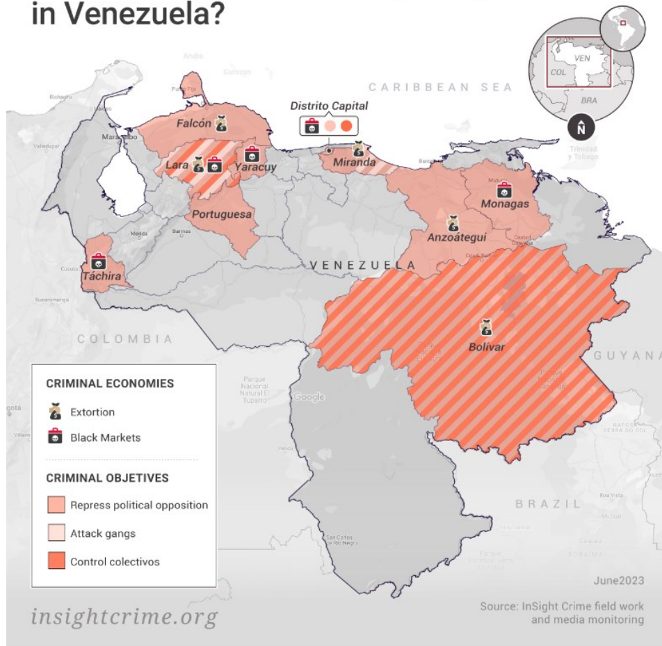
Map 3. Presence and activities of the CUPAZ 355

A research report produced by the UCAB, based on a survey conducted among victims of displacement by colectivos , indicated that the profile of victims of colectivos is diverse, and includes high school and university students, professionals, and business persons, mostly men, and that threats and other violent activities often extend to family members, including children. 356 Most incidents of targeting by colectivos were due to political motivations, including participation in, or support of, demonstrations; support of political opposition parties; and criticism of the government. 357 Additionally, business persons and manufacturers who are critical of the government are subjected to extortion, theft of their products, and attacks